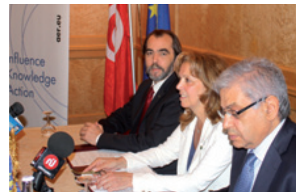
AER President with the Tunisian Ministers for Regional Development and for Vocational Training and Employment, May

2012 will most likely remain a year of uncertainty. In order to make it a successful year for regional development, Europe needs AER as much as AER needs each and every one of you.