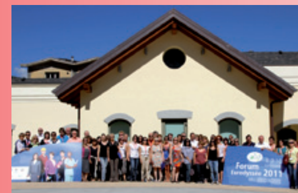
Successful gathering at the Eurodyssée Forum, Valle d'Aosta (I), September

The successful Eurodyssée Forum in Valle d'Aosta (I) was the occasion for the European Commission to recognize the potential of Eurodyssée and to say that the programme was highly valued by the Commission, which wants to help make it grow. AER and the Eurodyssée general secretariat will follow-up on this.