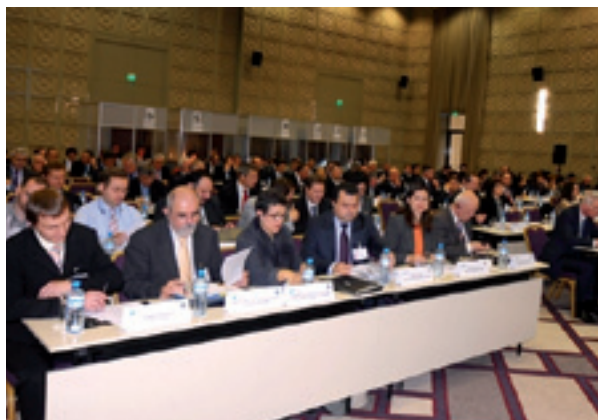
Black Sea regions strengthen their ties in Batumi (GE), April

Interregional cooperation, besides regional democracy, is also a key element for stability: this is why we asked for a strengthening of regional programmes in the future ENP. In challenging areas such as the Black Sea Basin joint projects among regions can help to promote dialogue and foster cooperation. The major Conference organised on 5-6 April in Batumi, Ajara a.R. (Georgia) helped to identify concrete axis of improvement regarding the next generation of ENP programmes. Held a few days before the