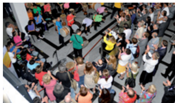
Culture and Health: from theory to practice - AER members enjoy the show, Istanbul (TR), September

In the framework of the Youth Entrepreneurship Strategies project which is aimed at promoting entrepreneurship education we have now finalised the questionnaire to be sent out to all AER members. Responses to this questionnaire will help identify best practices among our members and will be the basis of a guide to be published in 2012.