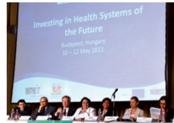
Conference 'Investing in Health Systems of the Future', Budapest (H), May

2011 sees the end of the FLINKMAN project and therewith the AER Emergency Planning network. AER members Hessen (D), Decentralised Administration of Kentriki Makedonia-Thraki (GR) and Noord-Brabant (NL) developed expertise on how to involve all relevant stakeholders in the development of flood risk management plans.