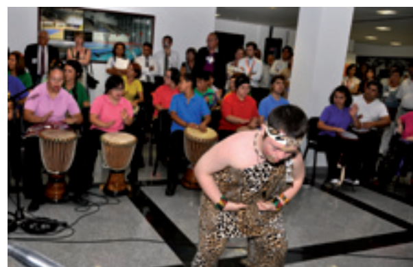
Culture and Health: Children with disabilities offer a memorable live show, Istanbul (TR), September

We have also engaged in the debate on the future of cohesion policy. In the current period, only 20% of the funds allocated to health have been absorbed to date. AER has been associated to projects assessing the levels and quality of investments in health and encouraging the health sector to identify and use the opportunities offered by cohesion policy funds. A full-scale information campaign will be launched for 2012, as health is a secondary priority for post-2013 and regions need to be made aware of how they can use funds for health-related investments.