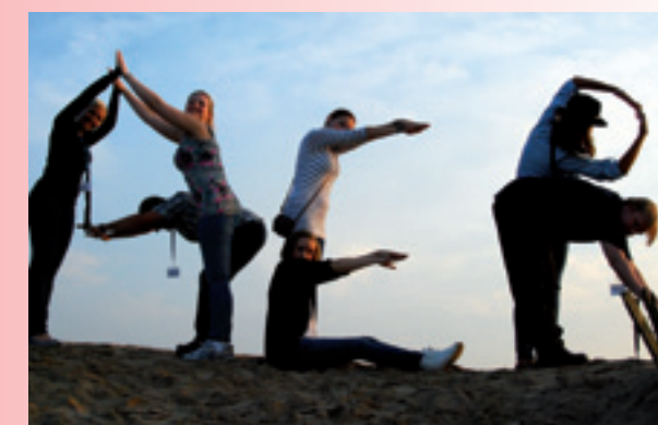
YRN members embody AER