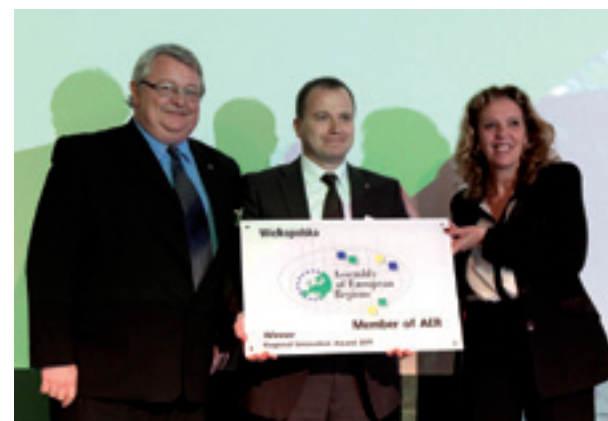
Wielkopolska region (PL), prized with the AER Innovation Award 2011, Açores (P), November

The aim of the 2nd European Regions Energy Day "Investment in sustainable energy – Regions as motors for growth and innovation" was to demonstrate the success of both territorial action and public-private cooperation in the face of the energy crisis. A survey on regional investment in energy projects was published, with the aim to analyse how regional authorities handle energy investments. The report highlights the incentives that are used to increase business involvement in energy projects as well as different factors that hamper or facilitate the deployment of green energy projects in regions. Lastly, 2011 sees the closure of the MORE4NRG project. After three years of collaboration, partners can proudly showcase the results of 5 peer reviews and many good practice transfers on green energy and climate change.