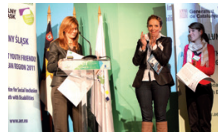
Catalunya (E) receives MYFER Award, Açores (P), November

with NGOs and member regions representatives. An action plan for Roma inclusion has been adopted and AER has joined the Congress of Local and Regional Authorities' Core Group responsible for setting up the European Alliance of Cities and Regions for Roma Inclusion.