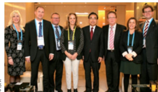
AER delegation takes part in NEAR annual meeting, Seoul (South Korea), November

Apart from the Mediterranean zone AER developed cooperation with North East Asia. At the invitation of the Association of North East Asian Regions, an AER delegation participated in their annual meeting in Seoul (South Korea) as guests of honour representing Europe. Transport policy, energy and the environment were identified as areas for cooperation.