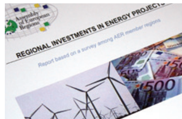
AER Report widely disseminated at the Energy Days, April

After three years of on-going activities and a full agenda, PRESERVE and its 13 partners close their actions on sustainable tourism. Through the final conference and publications, partners proudly share the results of their 6 peer reviews and action plans as well as a wide series of good practices identified.